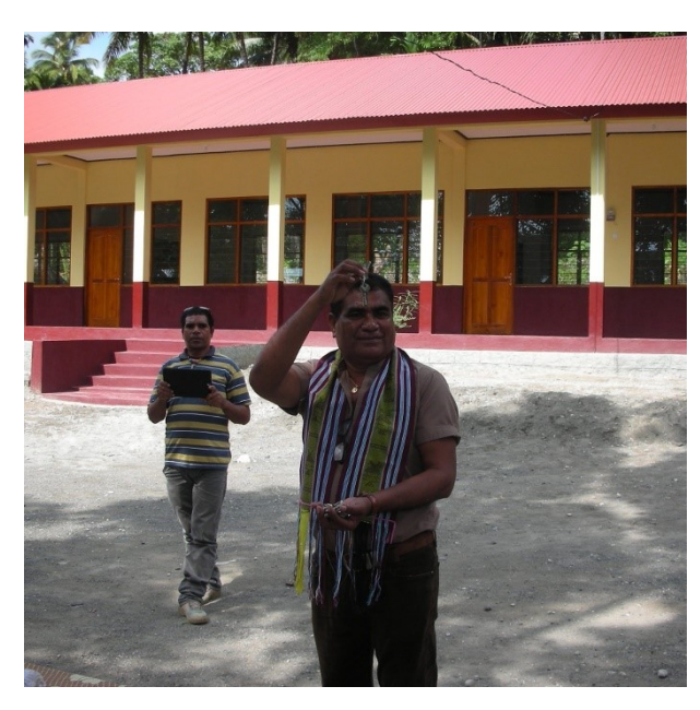
Photos of opening ceremony of Buruma School, including final handover of keys. (Look at that roof!)