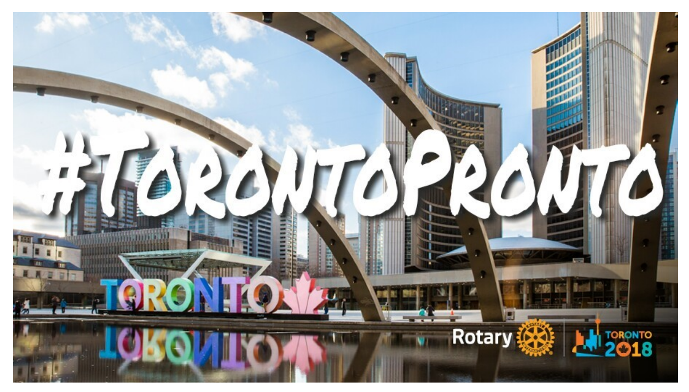
23 - 27 June 2018