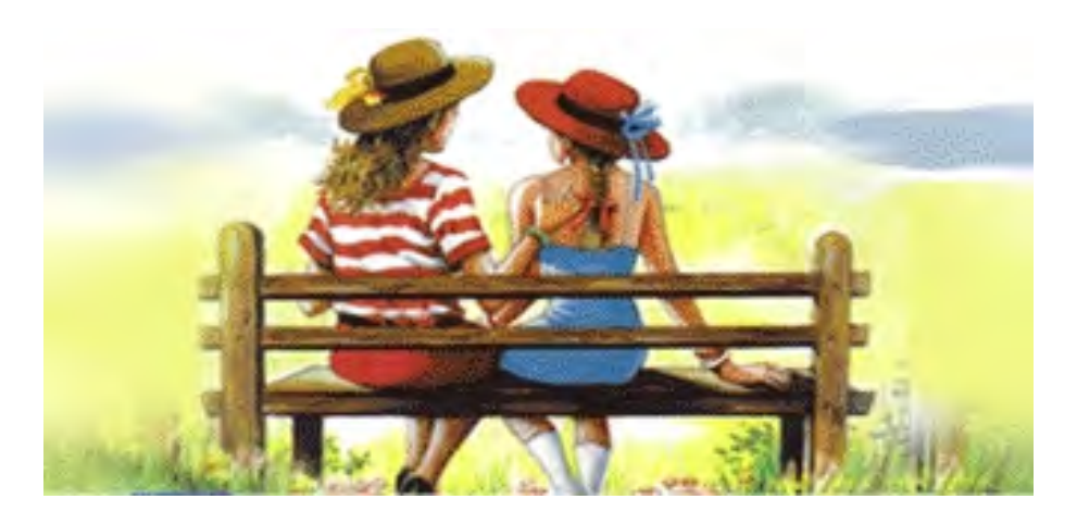
Remember - If it doesn't feel right, it isn't right.